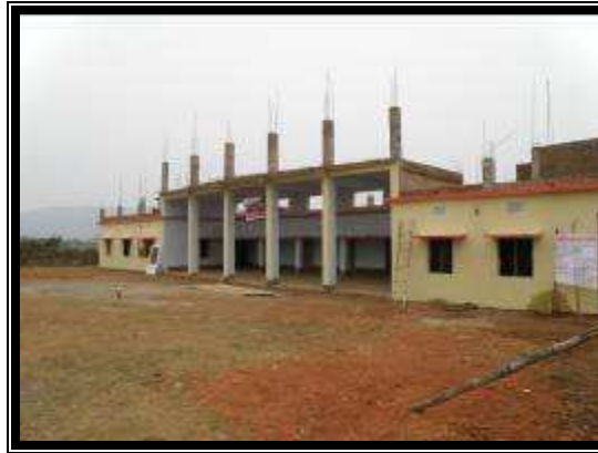
Under Construction: Future School for the Children